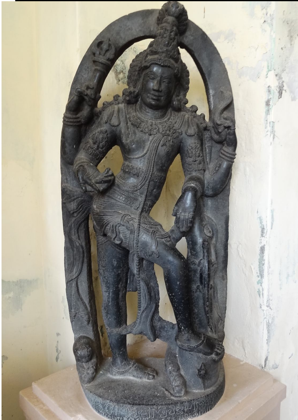
Dwarapalaga Sculptures- Art Gallery, Thanjavur