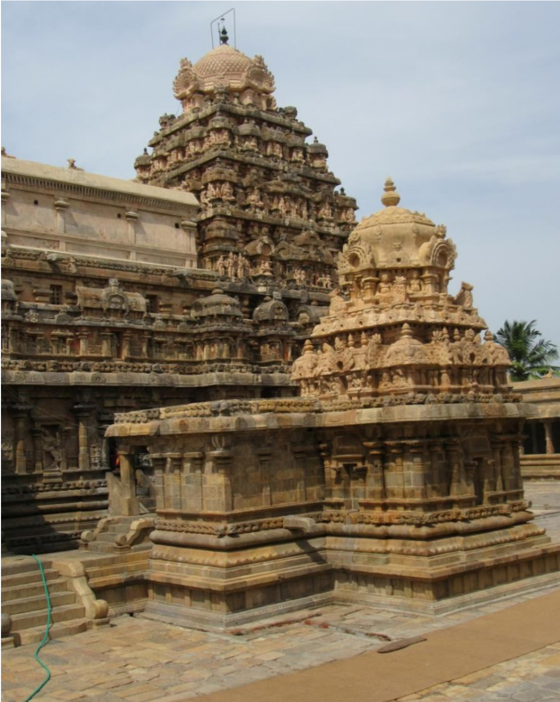
Airavateswara Temple Complex, Darasuram