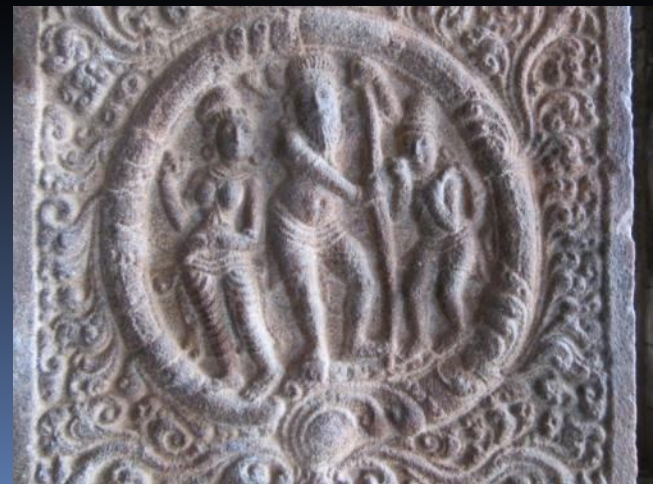
Pillars with Sculptured Panels